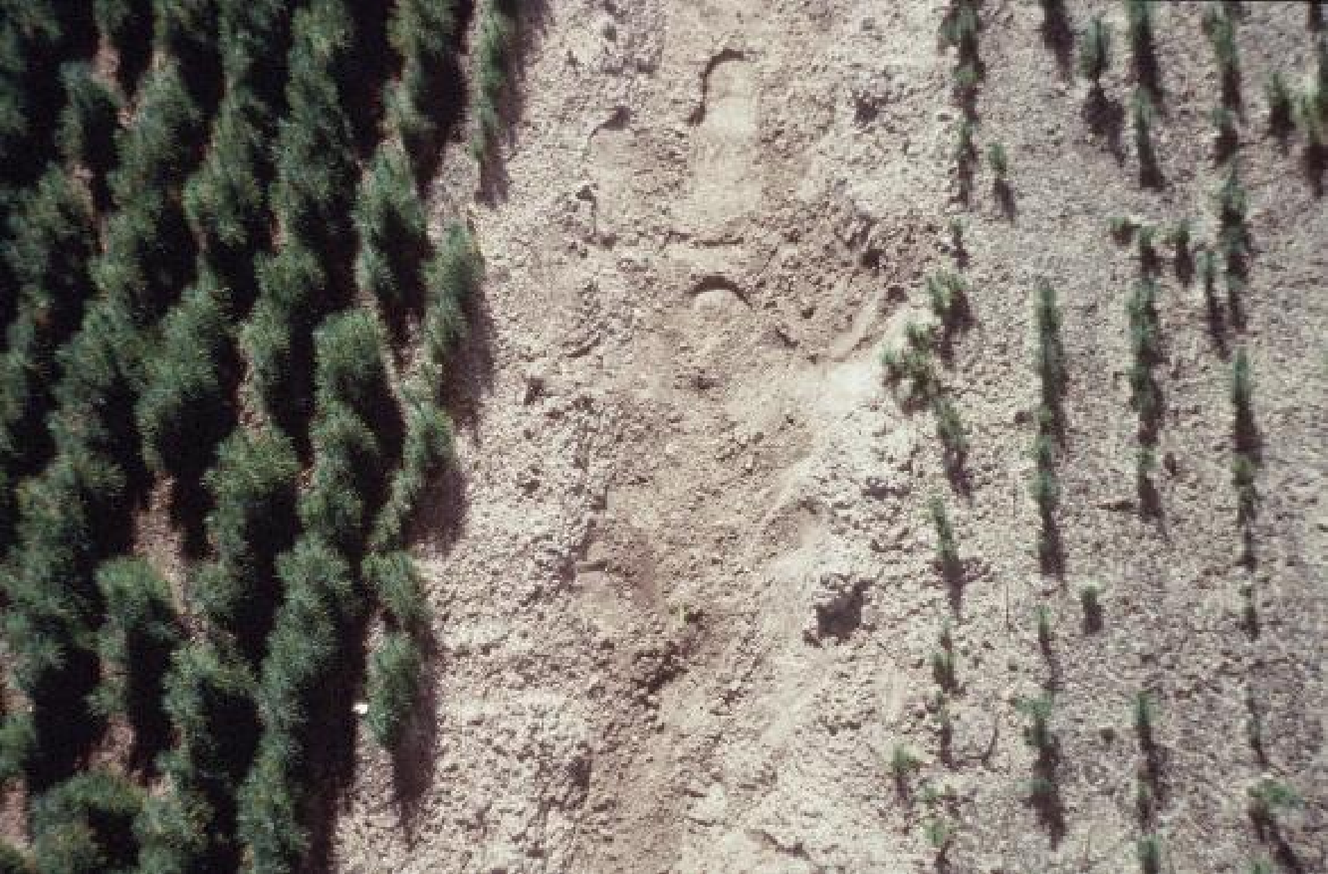
Insecticide treated bed