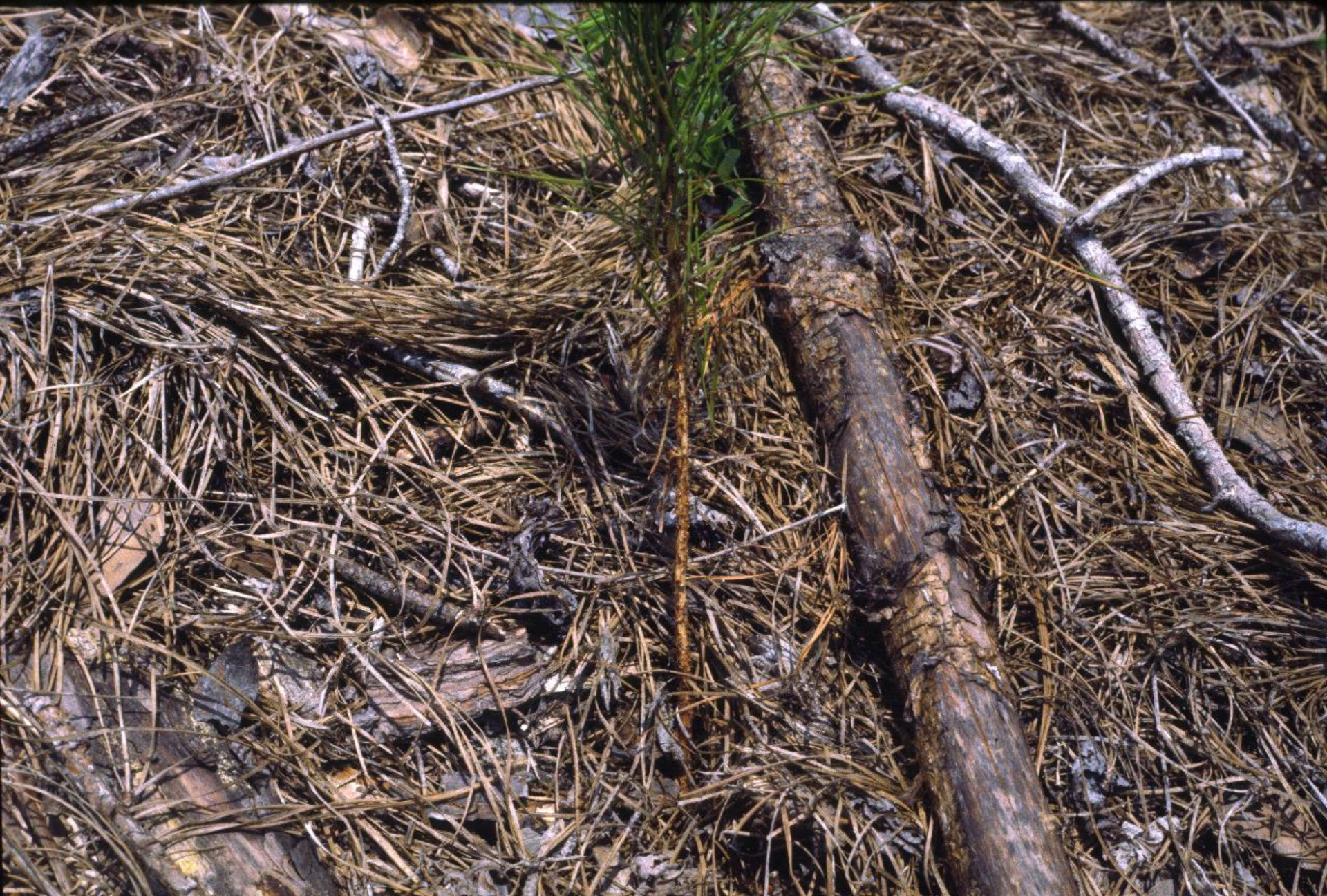
Pales Weevil Damage