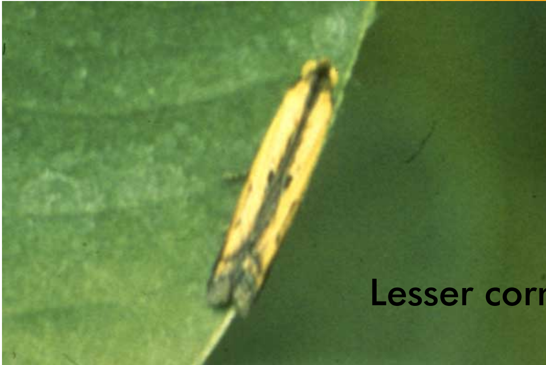
Lesser cornstalk borer adult