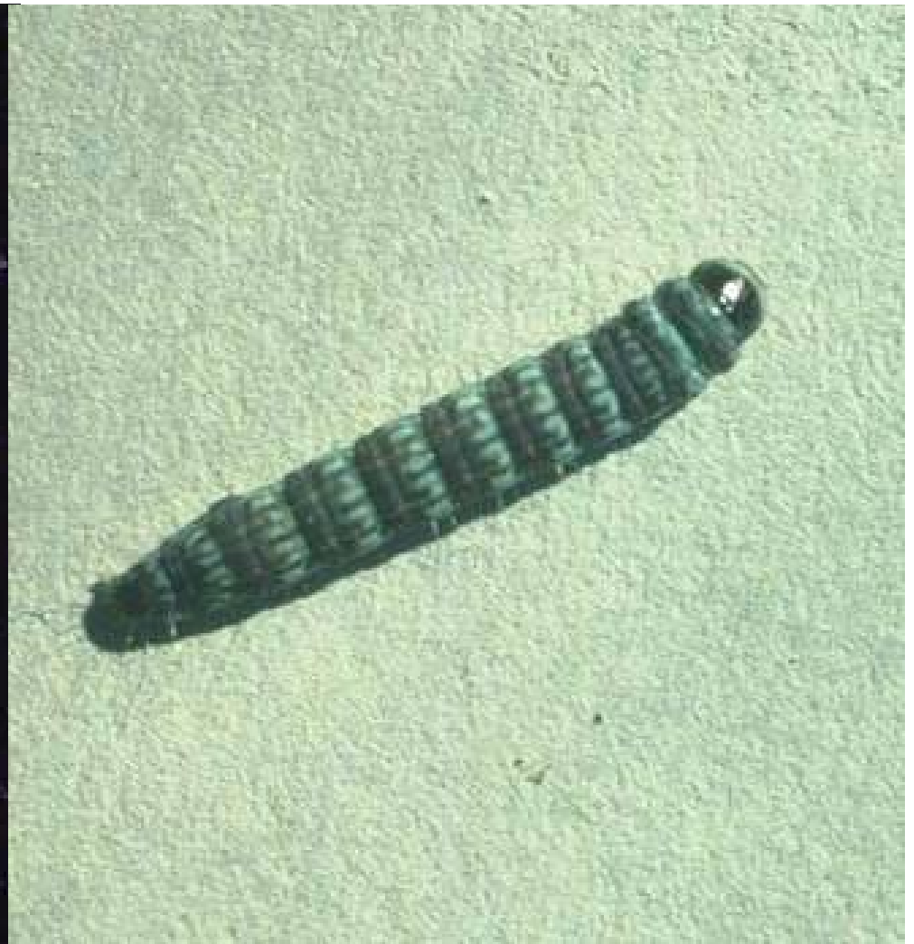
Lesser cornstalk borer larva