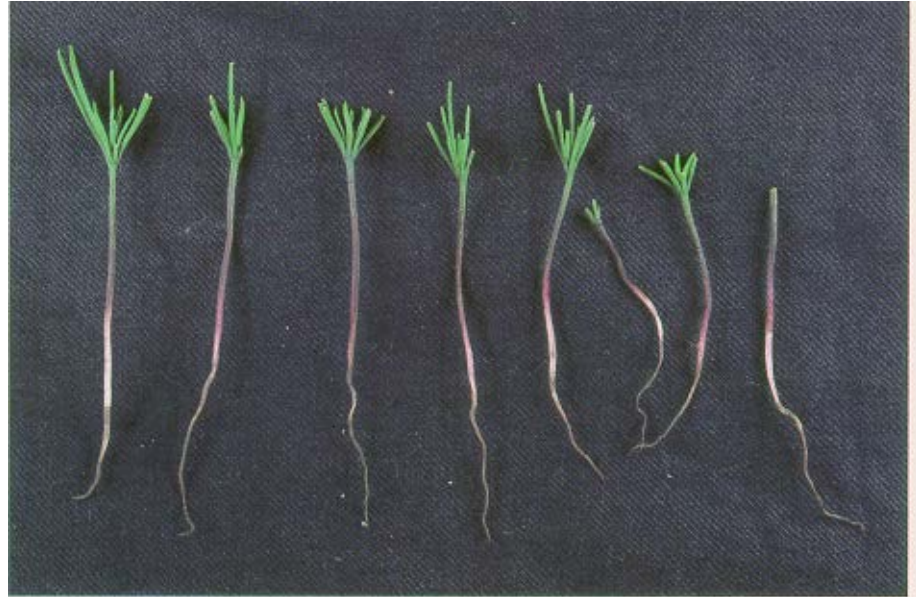
Figure 49-1 —Cutworm damage on young conifer seedlings. Note clipped needles.

Chemical sprays and fumigation are effective chlorpyrifos, Asana, Discus