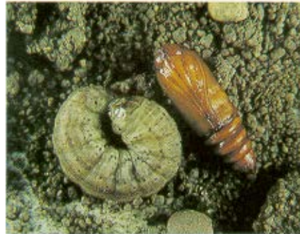
Figure 49-2 —Dingy cutworm larva (left) and pupa.