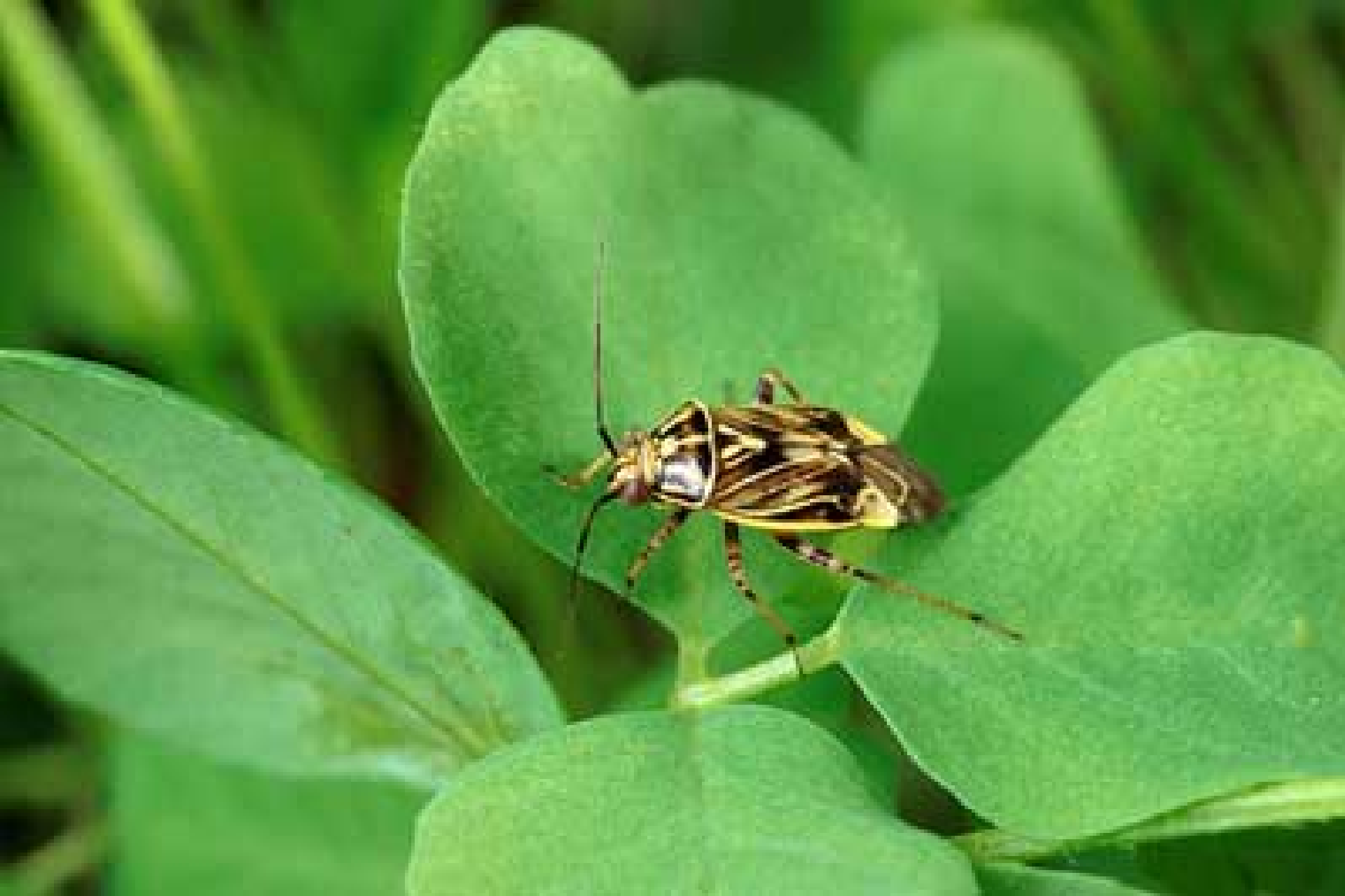
Tarnish plant bug – Lygus Bug