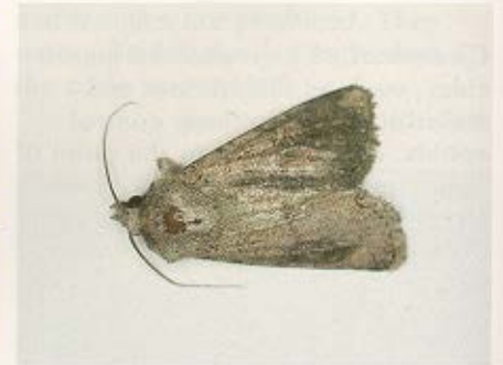
Figure 49-3 —Dingy cutworm adult.