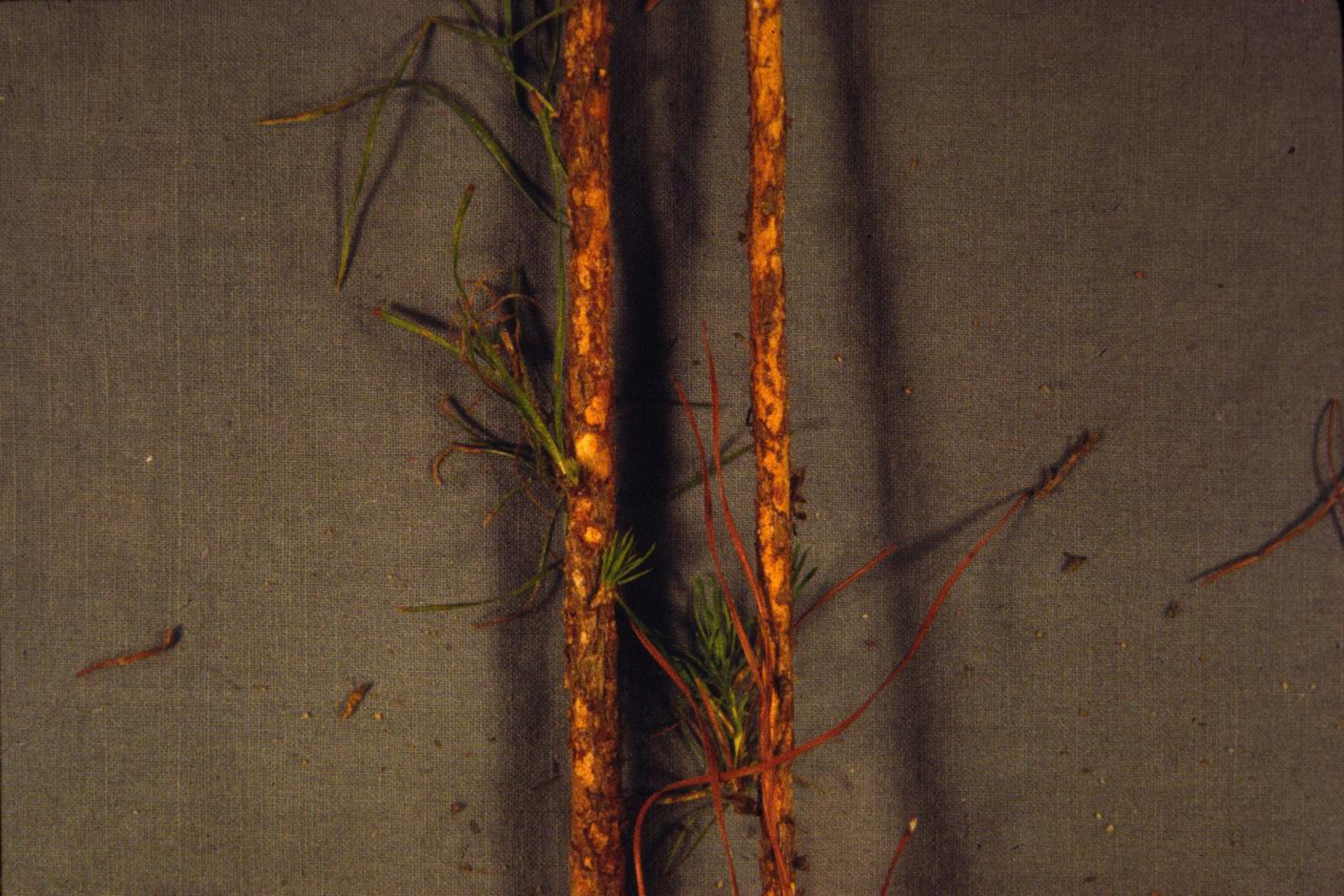
Pales Weevil Damage