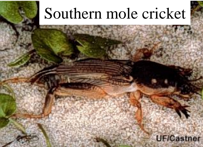
Southern mole cricket